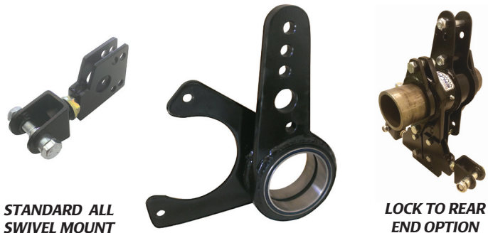
STANDARD ALL SWIVEL MOUNT

Nylon Or Steel Type Bearing Insert, Adjustable All Swivel Shock/Spring Mounts, Adjustable Shock Drop, Adjustable Radius Rod Holes, Powder Coat and All Hardware.